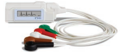
Vision Express Holter Analysis System and H3+ Holter Recorders